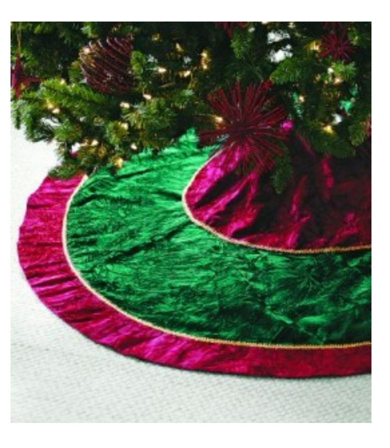
Two Piece DIY Tree Skirt

Use crushed velvet in colors of your choice to create this simple DIY tree skirt.